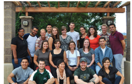
SAHE 2013 Cohort