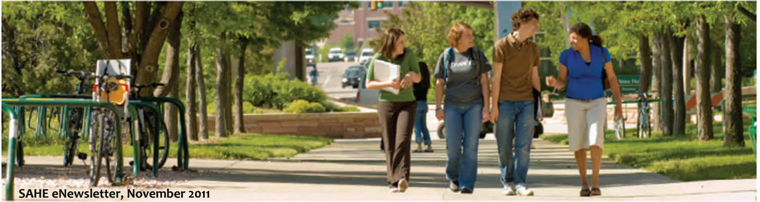
SAHE eNewsletter, November 2011