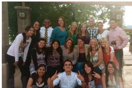
SAHE 2012 Cohort

sahe Student Affairs in Higher Education